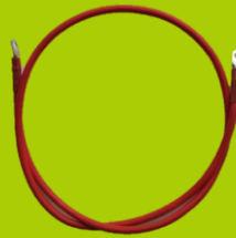
3: Negative Cable